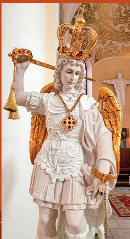
■ Figure of St Michael the Archangel

O glorious prince, St Michael, chief and commander of the heavenly hosts, guardian of souls, vanquisher of rebel spirits, servant in the house of the Divine King, and our admirable conductor, who shines with excellence and superhuman virtue, vouchsafe to deliver us from evil, who turn to you with confidence, and enable us by your gracious protection to serve God more and more faithfully every day. Amen.