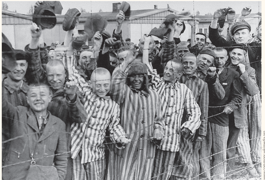
■ Young and old survivors in Dachau cheer approaching U.S. troops on 29 th April, 1945