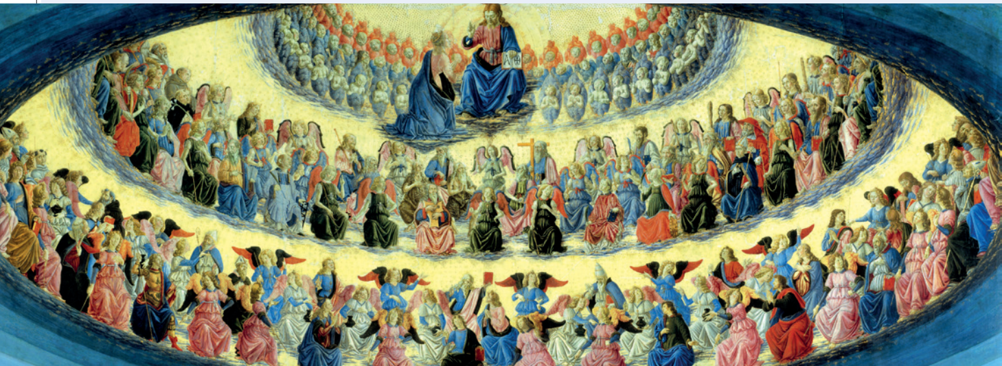
■ The Assumption of the Virgin by Francesco Botticini, circa 1475/76