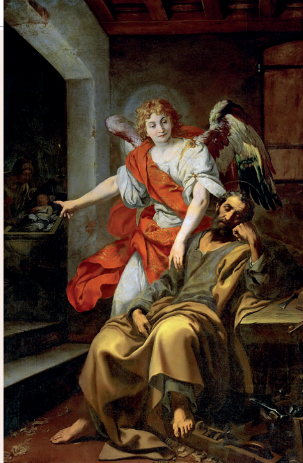
■ St Joseph's Dream by Daniele Crespi, circa 1620-1630

Let us not waste the Year of St Joseph. This is a great occasion to know St Joseph more closely and to turn to him for any help to obtain comfort and relief in the heavy human troubles. The modern world is tormented and so is man. Only prayer can lead you through an increasingly difficult life, because prayer paves the way for good and helps to overcome evil. So let us pray like St Joseph did.