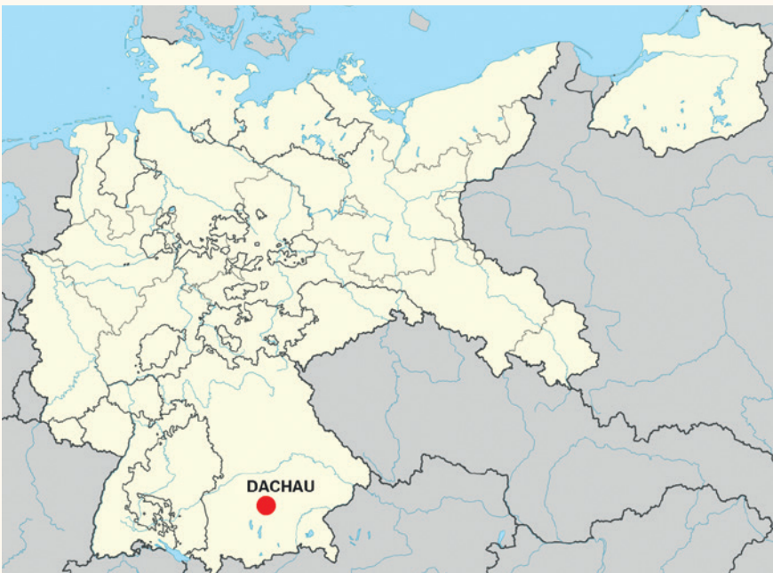
■ Map of Nazi Germany

However, it lasted only until September 17 th when all the German priests were separated from the rest of the clergymen and moved to block 26. From that moment the chapel stayed closed for Poles. Sometimes the German priests secretly shared their host and wine to enable Polish priests to celebrate the Holy Mass in the barracks between bunk beds. Some priests had a chance to celebrate the Mass in this way at least once during their few years’ stay in Dachau. The host was broken into twenty or more pieces so that everyone was given at least a bit. The Eucharist was delivered stealthily to those who were ill in the camp hospital, as well as to those dying of typhoid. Jesus, present in the Holy Communion, gave them the strength to survive, or helped them to die with dignity. Although it was forbidden, they