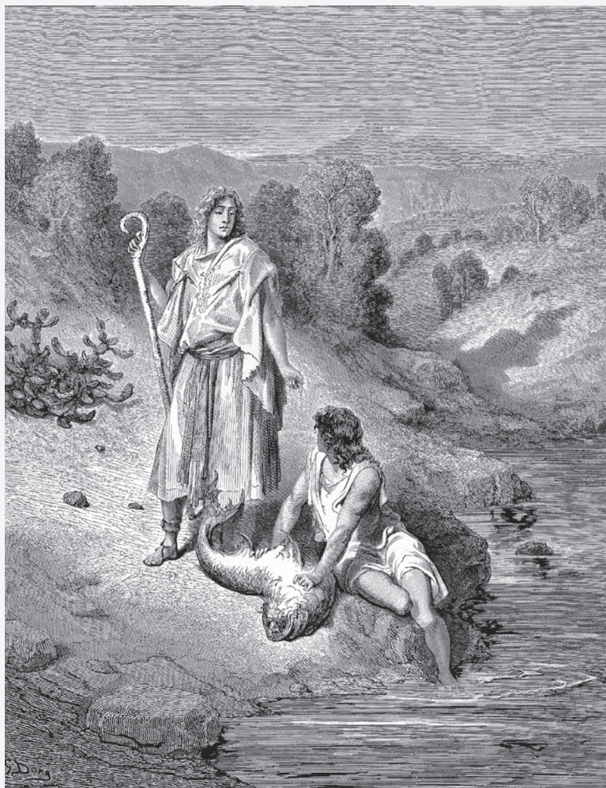
■ Tobias and the Angel, in illustration in Gustave Dore's English Bible, 1866

The two of them were shaken; they fell face down, for they were afraid. But he said to them, “Do not be afraid; peace be with you. Bless God forevermore. As for me, when I was with you, I was not acting on my own will, but by the will of God. Bless him each and every day; sing his praises. Although you were watching me, I really did not eat or drink anything - but what