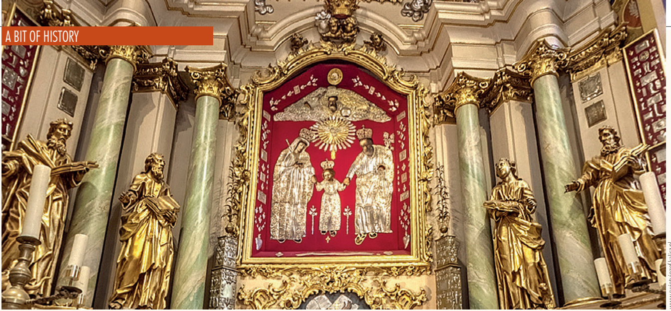
■ The miraculous painting of the Holy Family in the Shrine of St Joseph, Kalisz, Poland