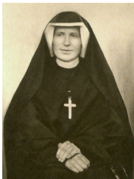
■ St Maria Faustina Kowalska

Lord endowed her with great graces – with the gift of contemplation, with a deep knowledge of the mystery of the mercy of God, with visions, revelations, the hidden stigmata, with the gift of prophecy and of reading into human souls, and also with the rare gift of mystical espousals. As lavishly gifted as she was, this is what she wrote: “Neither graces, nor revelations, nor raptures, nor gifts granted to a soul make it perfect, but rather the intimate union of the soul with God. My sanctity and perfection is based upon the