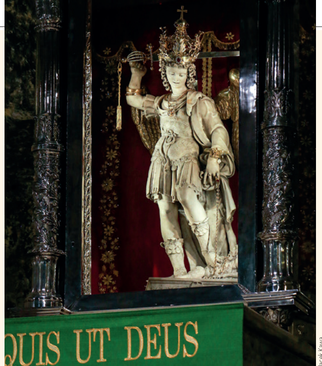
■ St Michael the Archangel from the Shrine in Monte Sant'Angelo, Italy

W e wish to penetrate deeper into the mystery of St Michael the Archangel. He is the most important and the greatest of the angels but he is also a mystery to us, humans. We know very little about him.