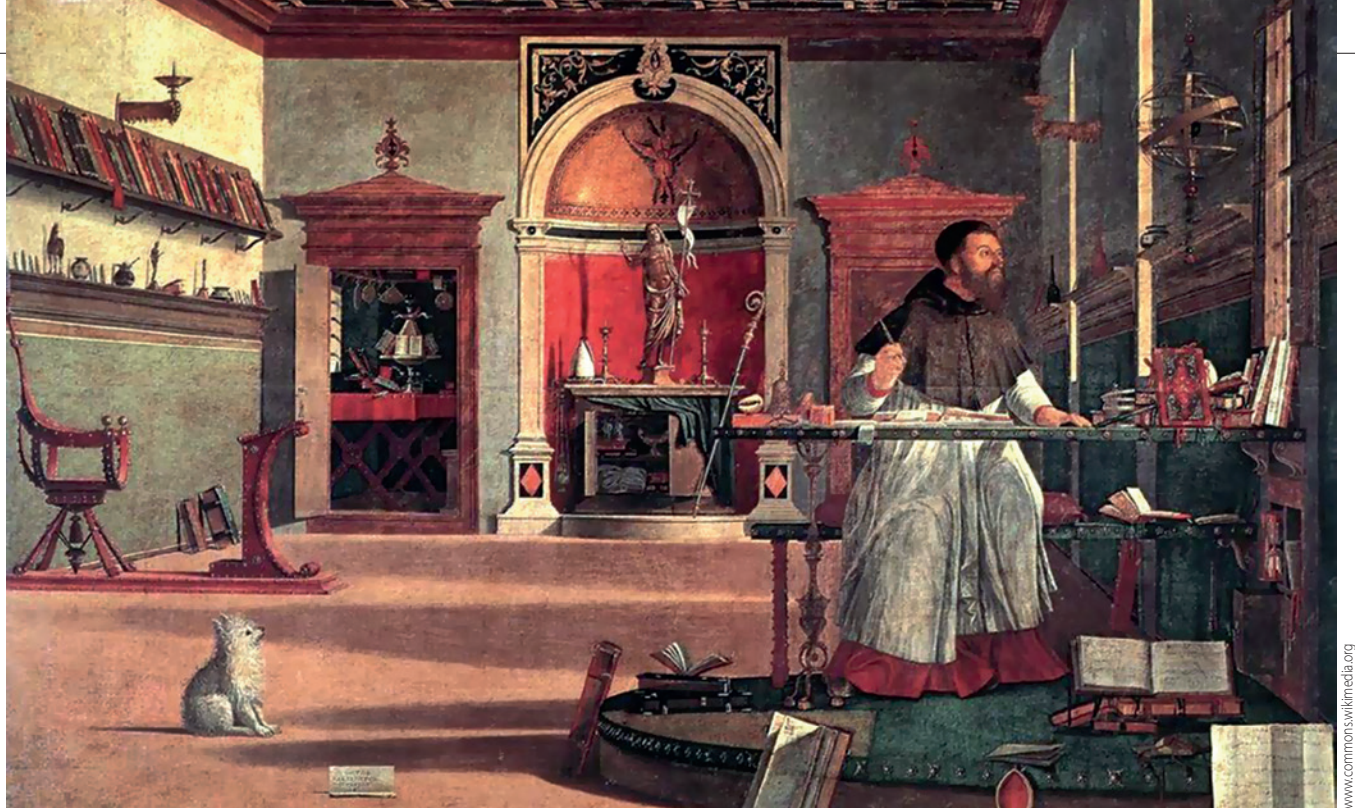
■ Vision of St Augustine by Vittore Carpaccio, 1502

that they might see the day when they would drink abundantly of the waters of Eternal Life.